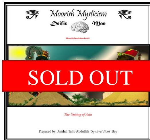
Moorish Mysticism $70