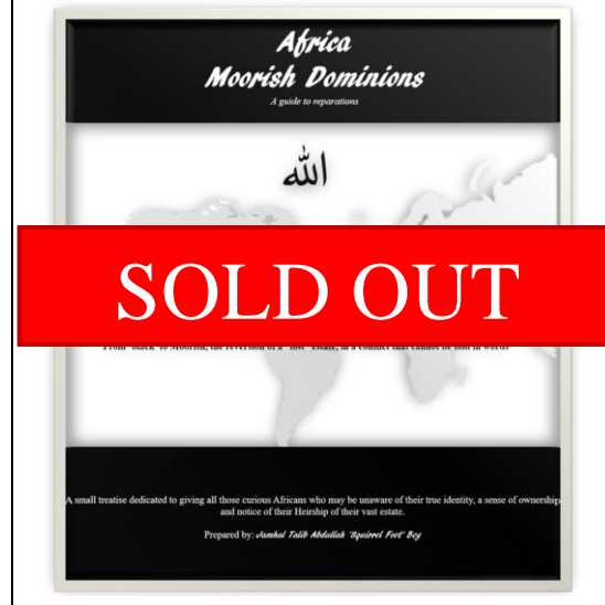
Moorish Dominions $80